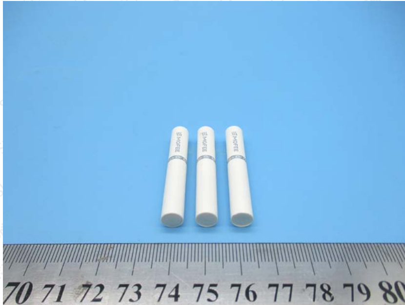
CPC240031-1: HNB tobacco - Amber